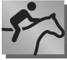
riding a horse